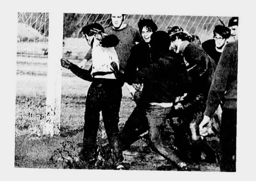
Practice Makes Perfect...